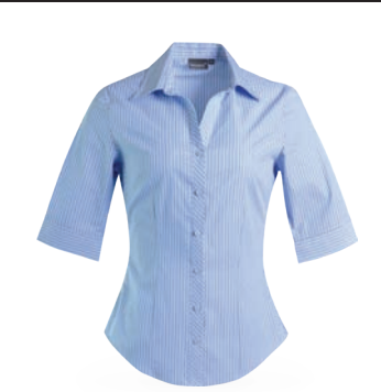
VERTISTRIPE WOVEN SHIRTS

MEN'S SHORT SLEEVE: MWS5 MEN'S LONG SLEEVE: MWS6 LADIES' SHORT SLEEVE: LWS5 LADIES' LONG SLEEVE: LWS6