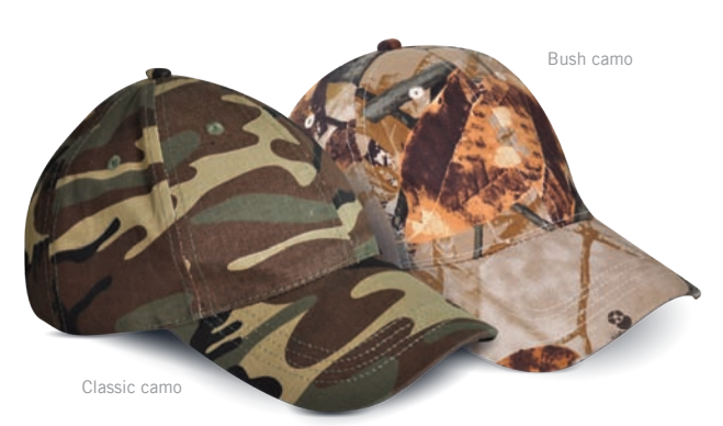
NOTE: CAMO DESIGN MAY HAVE VARIATIONS